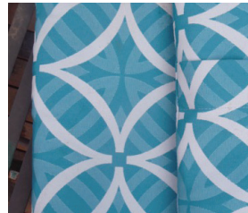
Dec. 20th 2015: After 50 days, a cold machine wash without detergent, the Warwick outdoor fabric held it's colour, shape & protected the cushion insert from decay.