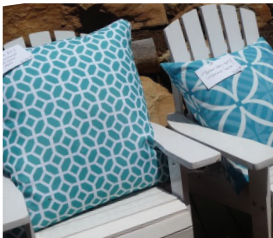
Oct. 31st 2015: Both cushions were exposed to the sun, rain, wind & heat for 50 days straight.

Call today to arrange a free no obligation measure and consultation. It's really that easy!