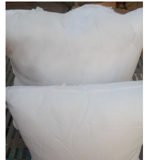
Top: Insert decay without the Warwick Fabric protection!